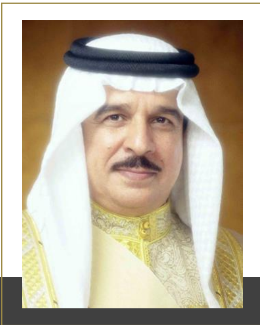
His Majesty King Hamad bin Isa Al Khalifa