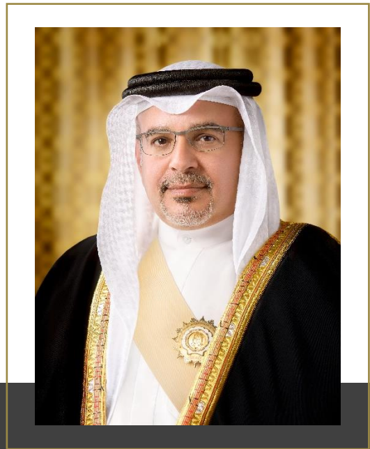
His Royal Highness Prince Salman bin Hamad Al Khalifa

The Crown Prince, Deputy Supreme Commander and Prime Minister